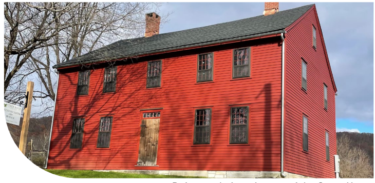
Before and after pictures of the Camp House