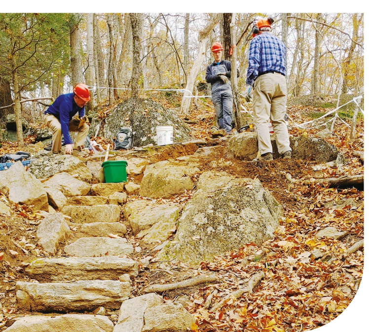
Steep Rockers laying 20 steps on Meeker Trail, Macricostas Preserve

The training involved a lot of information delivered in a very short period. Over two days, we met with Artie Hidalgo and Kent Strivers of the Jolly Rovers Trail Crew, a highly trained and skilled group of volunteers who specialize in trail stonework and providing public access to iconic places—a real niche in the world of conservation. They taught us to safely and properly handle the tools, most of them new and obscure to