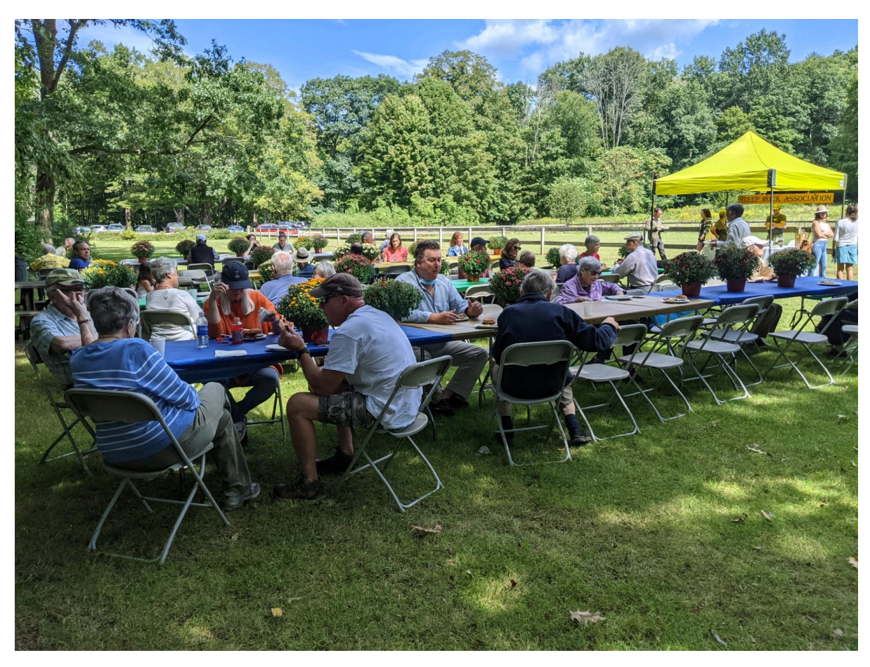
Annual Steep Rock Association Community Picnic