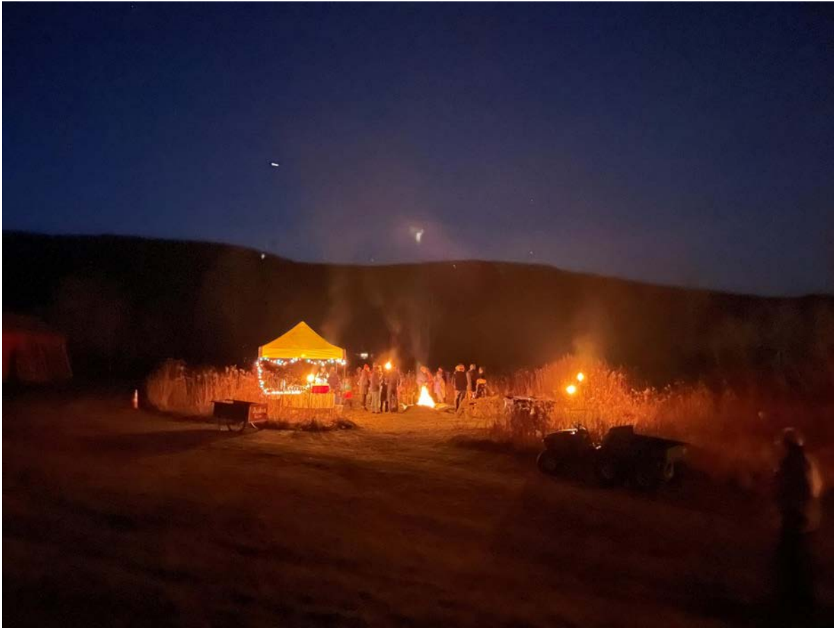
Winter Solstice Firepit 2022