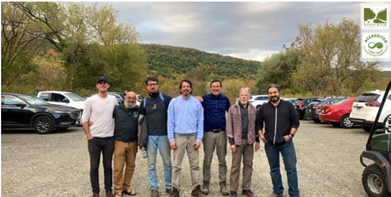
The "Steep Rockers" trained in advance trail construction and stonework.