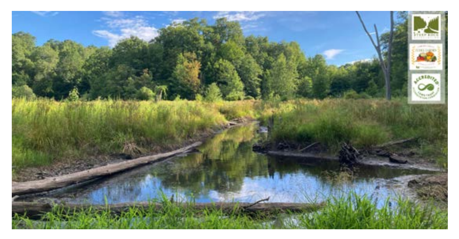
5-acre wetlands in Pinnacle Cliffs parcel