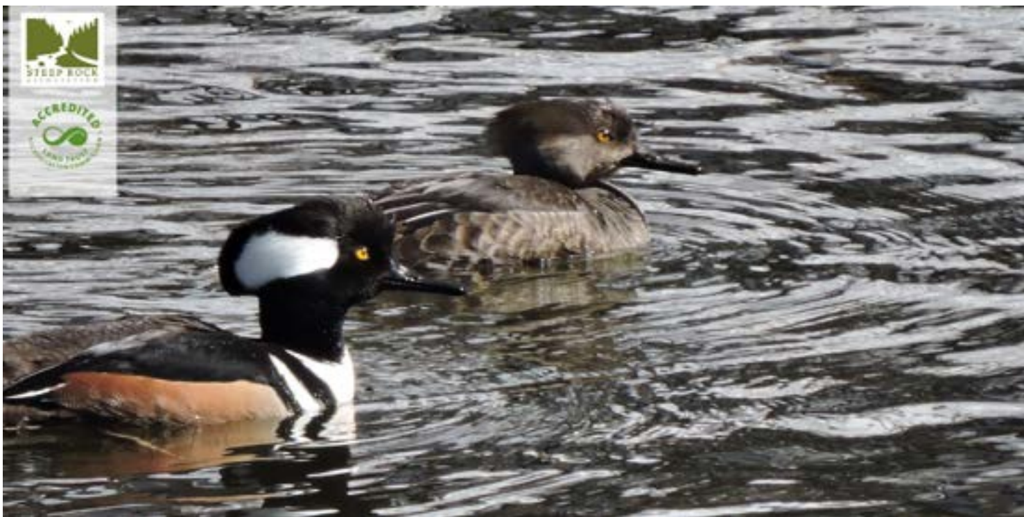
Hooded Mergansers