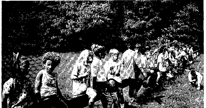
Washington Primary School second graders at Steep Rock.