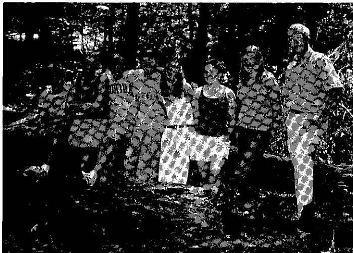
Shepaug High School AP Biology students, after a morning fighting invasives.