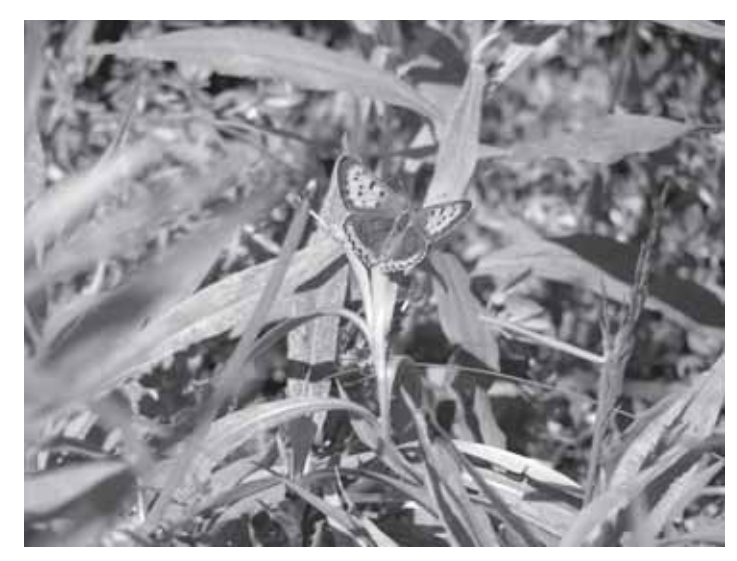
Bronze Copper (female), photographed at the Macricostas Preserve

Wish us luck! The animals, birds, insects, and plants that are such a wonderful part of Macricostas need your support.