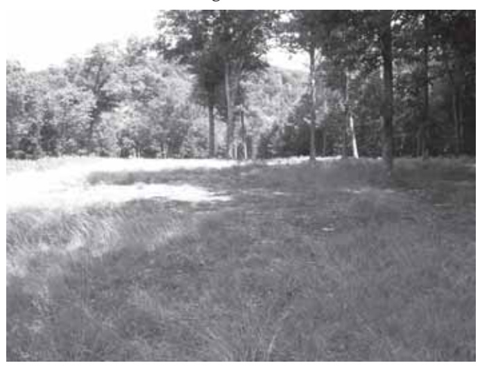
Middle Field, Steep Rock Reservation

Once the stumps are removed, the chips picked up, and the log piles relocated, we will then wait and see what grows in the newly disturbed areas. We will monitor the area for both invasive and native species. We will encourage native plants to grow and flourish. If invasive species move in, we will remove them. The end result will be a field comprised of native grasses, shrubs and wildflowers that can provide food and shelter for wildlife through all four seasons.