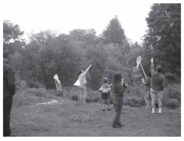
Pointing to a Monarch that's been tagged and released.