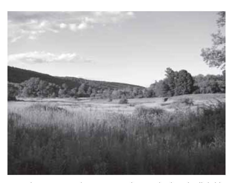
Reed Canary Grass threatening to take over the boardwalk field at Macricostas Preserve.

If that's not enough, one of the heaviest infestations of RCG is taking over the "Boardwalk Meadow" or the area north of Adam's Bridge. That particular spot is probably the most biologically diverse of any area in all the parts of Steep Rock; Bronze Copper, a state-threatened butterfly, and Alder Flycatcher, a state-threatened bird, both depend upon the native vegetation in this area. Unusual plants; Nodding Ladies' Tresses (a native orchid), Closed and Fringed Gentians, and Turtlehead – the host plant for the gorgeous butterfly Baltimore Checkerspot – are also being forced out by the creep of this plant.