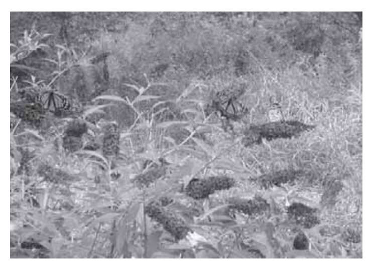
Three monarchs visiting The butterfly garden at the Macricostas Preserve. The garden was planted this spring and has been such a success that we plan to enlarge it.

Another habitat project is the butterfly garden planted this past spring near the parking area in the Macricostas Preserve, much to the delight of many species of butterflies and those who observe them. Shrubs such as Butterflybush, Buttonbush, Pepperbush and Bluebeard (Caryopteris) as well as annuals and perennials provide a plentiful supply of nectar for these colorful insects.