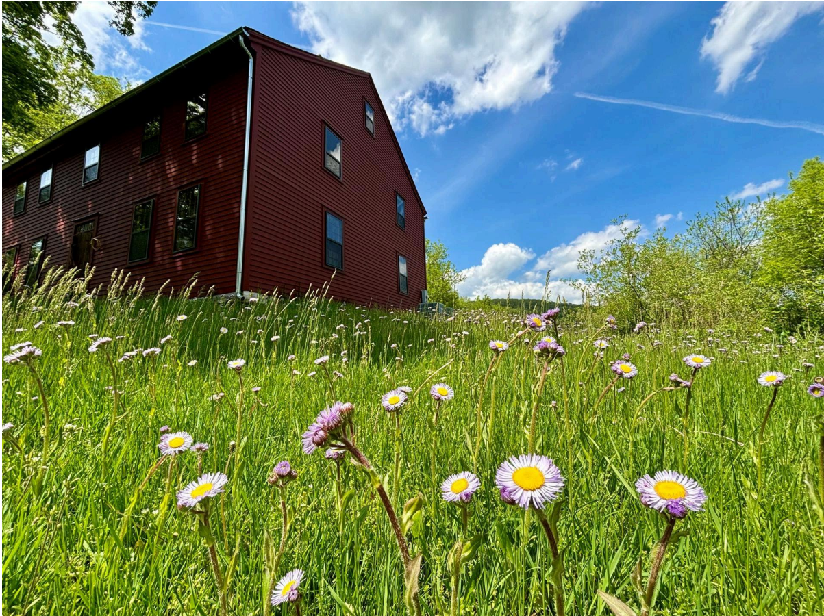
Spring day outside Camp House. Native common fleabane in full bloom (Dan Sherman)